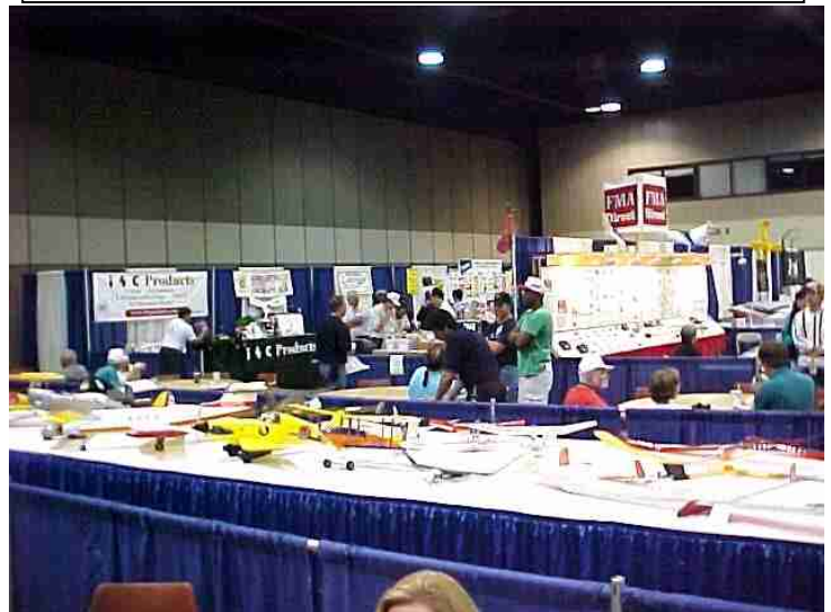
A display area for the contest models plus various booths manned by aeromodeling companies with their products.