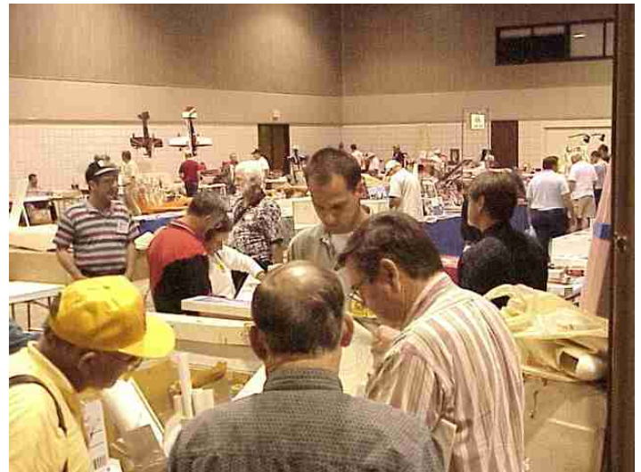
A picture of the swap tables that were manned at the 2004 SWAC.

The show features a 2-day event and reserving the Main Hall only for Manufacturers, exclusive distributors, sole importers, associations and publisher. We will introduce the Newcomers Pavilion, a specially designated area offering new companies the opportunity to promote their products at a reasonable cost.”