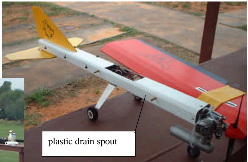
plastic drain spout

Greg gets ready for some enjoyable stick time with his PIG!