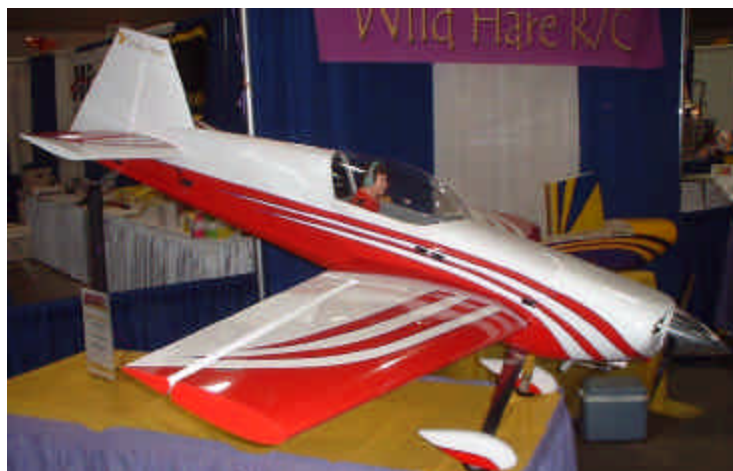
35% Giles 202 from Wild Hare. This is a really nice looking paint scheme.