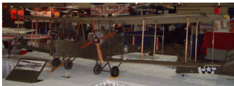
This is a 1/5 th scale Vickers VIMY. The model is a Sea Bees ARF. Yes, an ARF. The Span is 13' 9" with a wing area of 8020 sq. inches. The Owner is Jerry Burpee.

There was lots of room to fly your indoor electric planes. Here is a picture of all the tables set up for people to put their planes & R/C equipment. Some aircraft looked like planes, and others looked like insects.