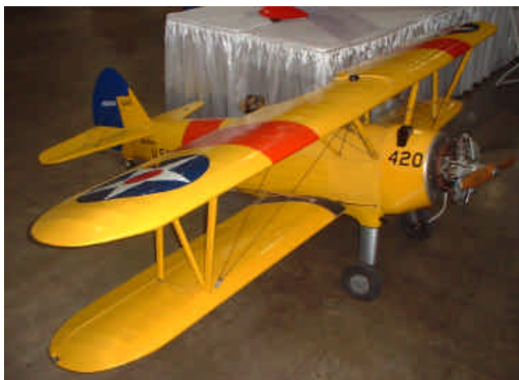
A PT17 Steerman. This one has a 10 hp 5 cylinder engine. Lots of nice detail work was done on this large scale machine!