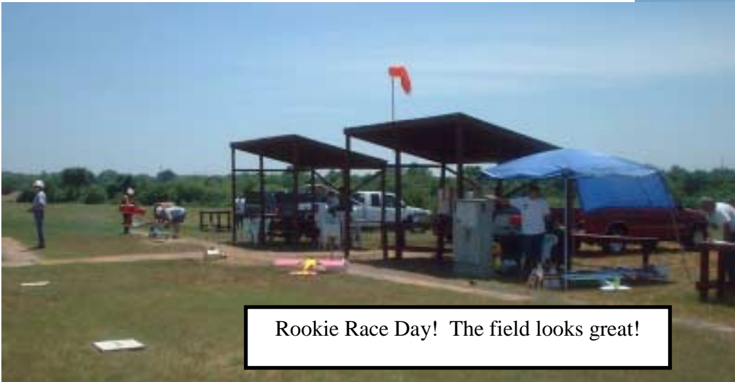
Rookie Race Day! The field looks great!