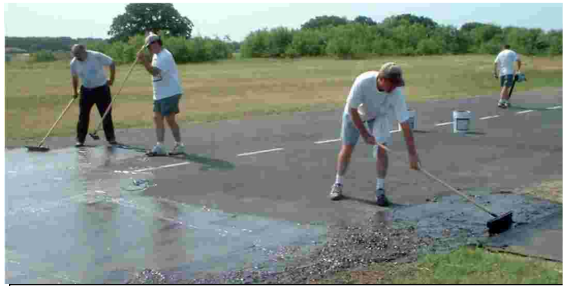
Only half way done. Weed whackers were on the other end clearing the edges

The project started at 9:00 and was finished by 12:30. I can't say enough about the turnout. You modelers are a great bunch to be associated with!