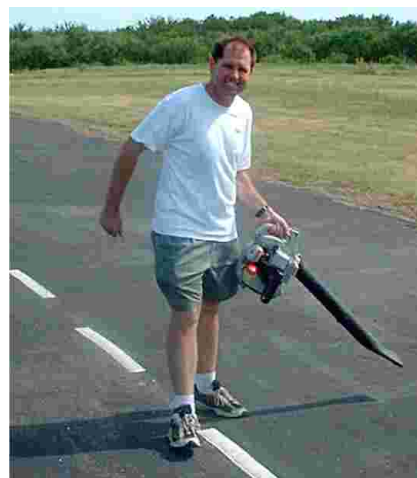
Ed's blowin them away...