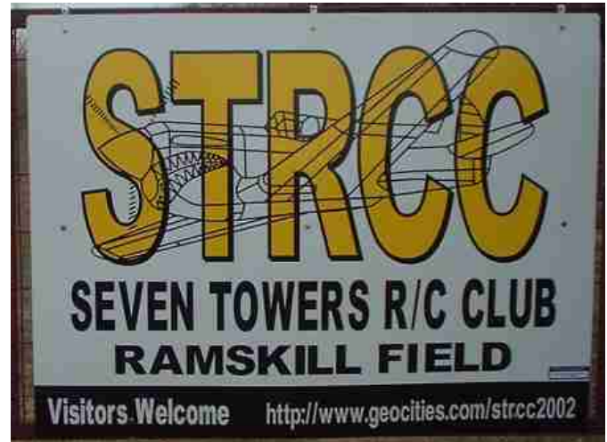
signs on the front gate