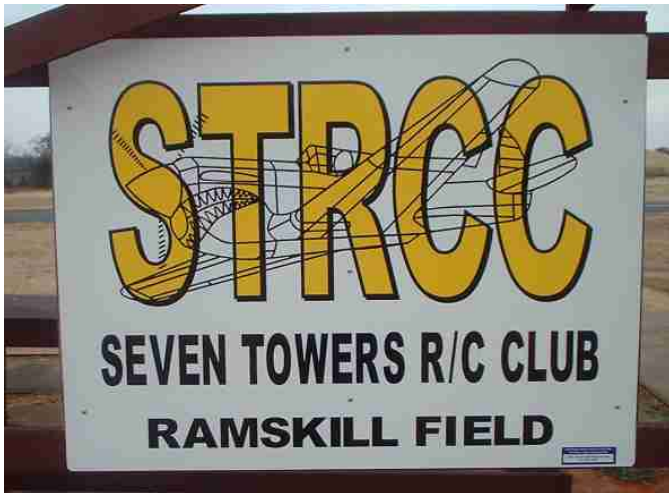
sign at the field